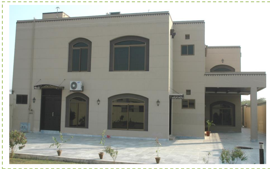
Building of Peace Center, Lahore

Peace Center Lahore is a project of the Dominican Order Ibn-e-Mariam, Vice Province Pakistan. It was inaugurated & blessed by His Eminence, Cardinal Jean-Louis Tauran, President, Pontifical Council for Interreligious Dialogue, Vatican, on 28 th of November, 2010. It was a dream which became a reality to have a place for dialogue among various religions, especially Muslims and Christians. At the blessing ceremony the entire Catholic and Church of Pakistan (Protestant) leadership along with Muslim, Hindu, Sikh and Bahai religious leaders were present to witness this event.