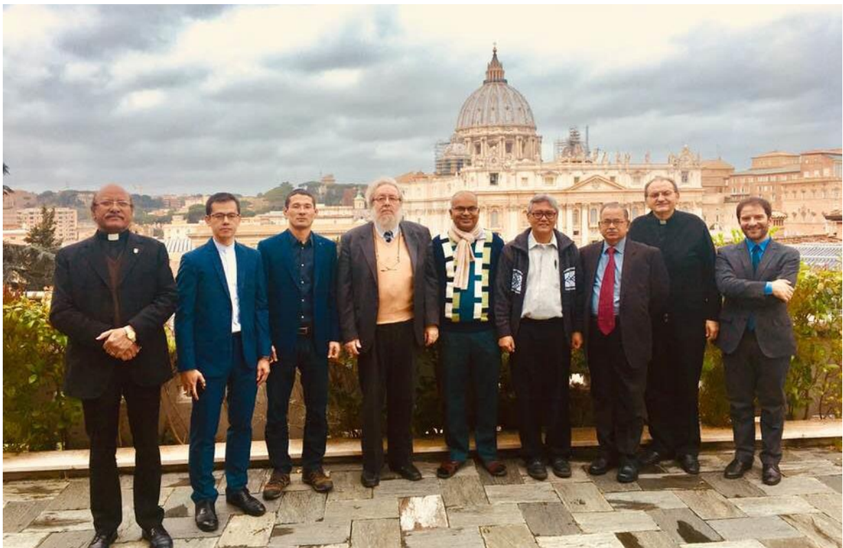
Group photo of all the writers and professors at CIAM