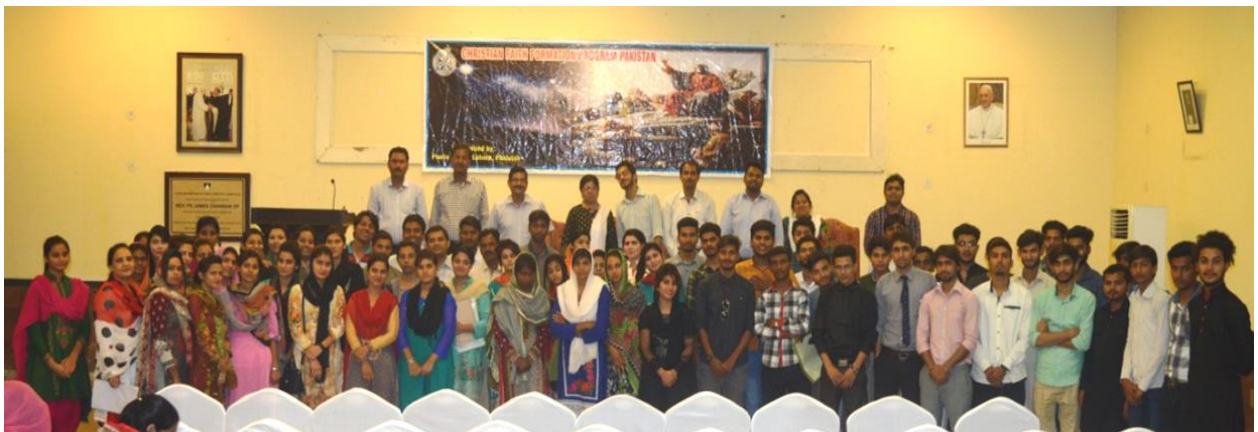
A group of Christian youth who participated in the Youth Formation Program